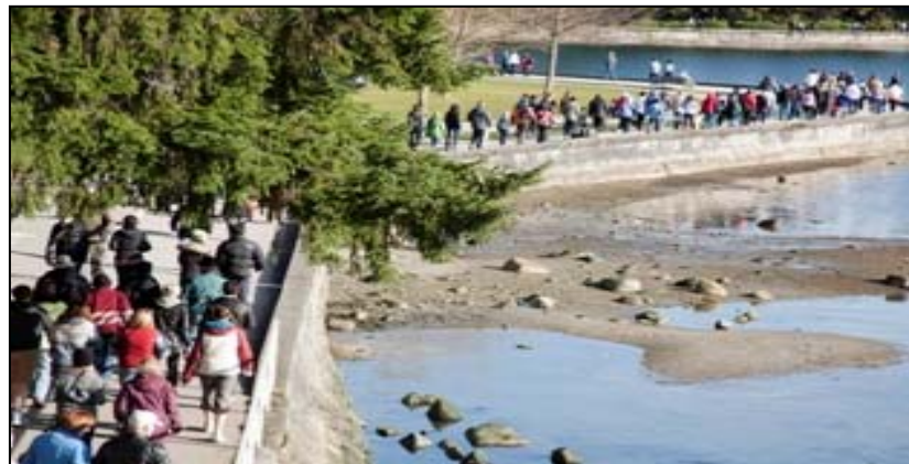
Walk for Memories 2011.